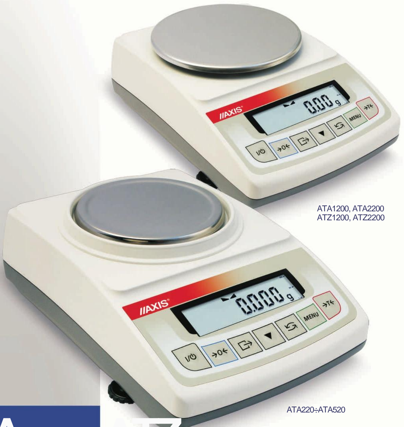
ATA1200, ATA2200 ATZ1200, ATZ2200