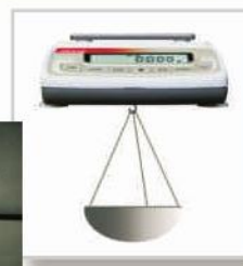
Weighed load hanging method